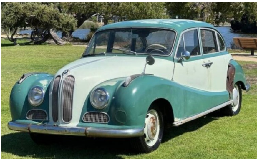
BMW 502 (photos via Barn Finds)

In 1952, a still rebuilding BMW introduced its first new design post-WWII car, the 501. Designed by Peter Szymanowski, the car's flowing lines gained it the nickname Barockengel or "Baroque Angel." It was solid, well built, roomy and comfortable, but the vehicle had a couple of strikes against it. One, the selling price was close to DM15,000 (about $3571). Two, the car was heavy at 3100 lbs; the 2-liter, 64 hp straight six engine could not move the BMW 502 (photos via Barn Finds) 501 in anything more than a sedate, stately fashion.