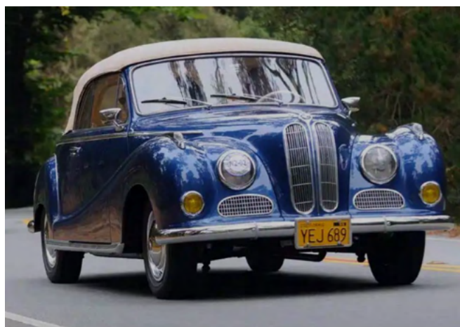
One of the rare cabriolets